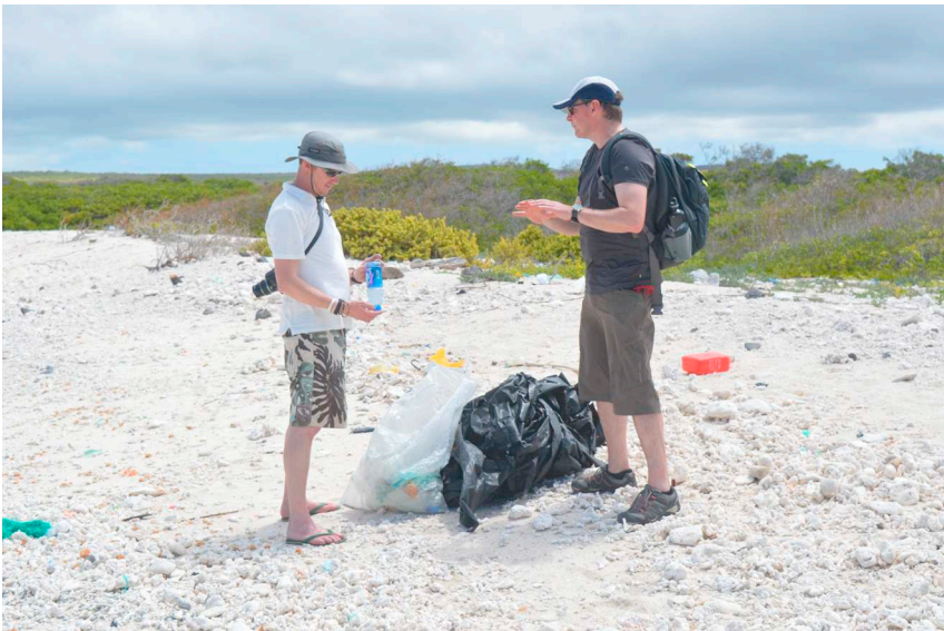
FIGURE 4.2 Members of the Science to Solutions workshop team collecting a representative sample of plastic objects from a remote beach in Galápagos, in 2018. The objects collected were then subject to ‘object itinerary’ investigations to help better understand where the items were coming from.

Part of the clumsy solution to plastic pollution in Galápagos involved using object itineraries (versions of which are also referred to as narratives or biographies), which have long formed a part of material cultural research (e.g. Joyce and Gillespie 2015; after Kopytoff 1986). In the Science to Solutions workshop, the team used object itineraries to investigate a plastic assemblage from a remote beach to help understand the source of the plastic waste accumulating there (Figure 4.2). This was achieved through building stories around each plastic item, one element of which was to use its condition (alongside information from labelling and biofouling) as an indicator of both how long it had first been at sea, and then how long it had been exposed on the beach – identifying its natural and its cultural transformations, in Schiffer's (1976) terms. Through this work, and by combining the evidence for longevity with evidence of the objects' origins including through oceanographic modelling (specifically, van Sebille et al. 2019), Galápagos plastics have predominantly been sourced to the Pacific coast of South America (specifically northern